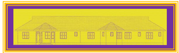
Architect's rendering of expanded convent

We have initiated our largest project to date, the expansion of the convent. When complete, this undertaking will double the size of the convent to eight rooms. It will also allow space for visiting medical personnel. The cost of this project is $25,000 and we hope to have it completed by the spring.